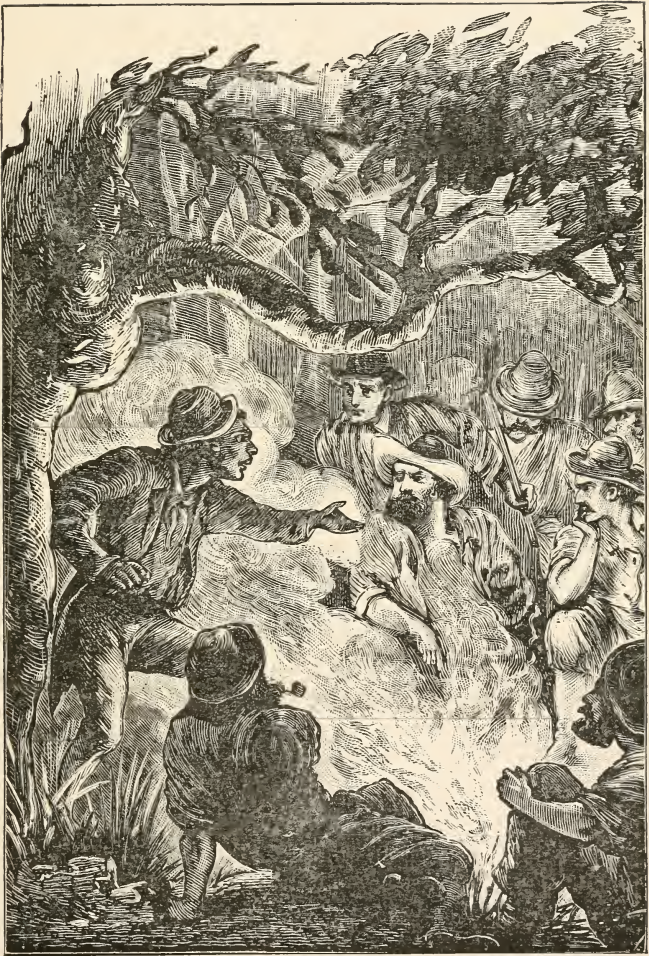
"NOW OR NIVER!"—PAGE 26.